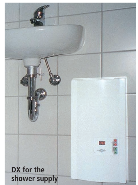
DX for the shower supply