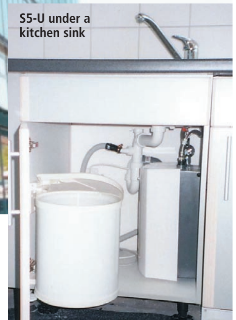
S5-U under a kitchen sink