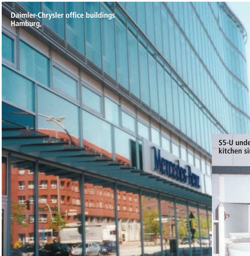
Daimler-Chrysler office buildings Hamburg,