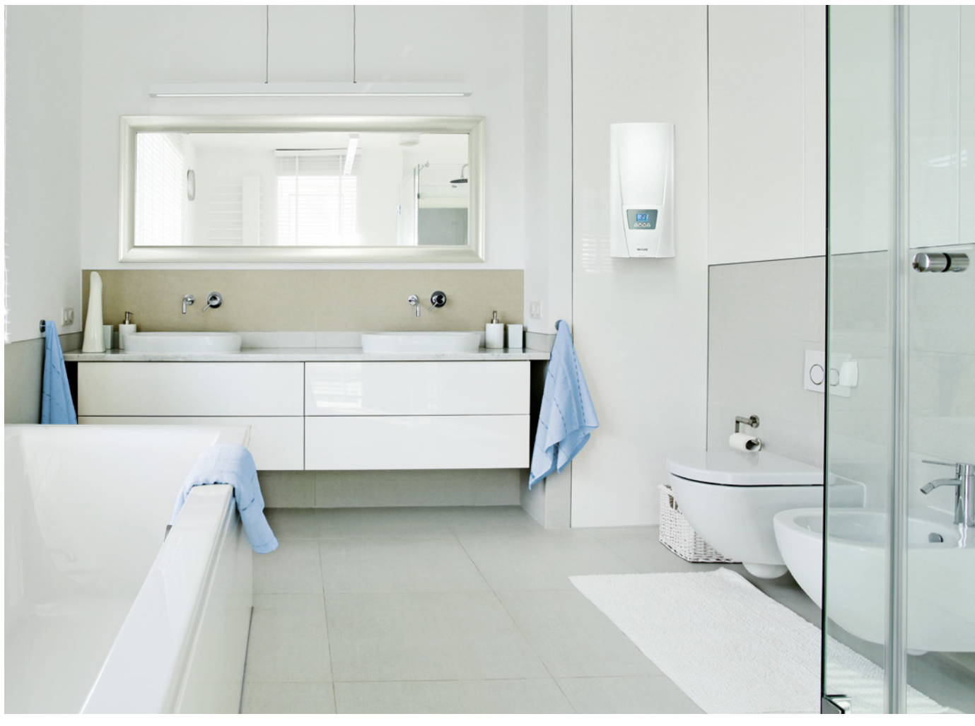
Subject to technical changes and version changes. Errors and omissions excepted. Date of publication: 08.17