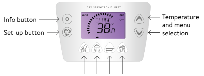
Four programmable application buttons

It's easy to see how economical the DSX is in operation: the selected temperature is displayed in large digits along with the power input at the time. The coloured backlighting indicates the selected temperature in a seamless progression from blue (cool) through purple to red (hot).