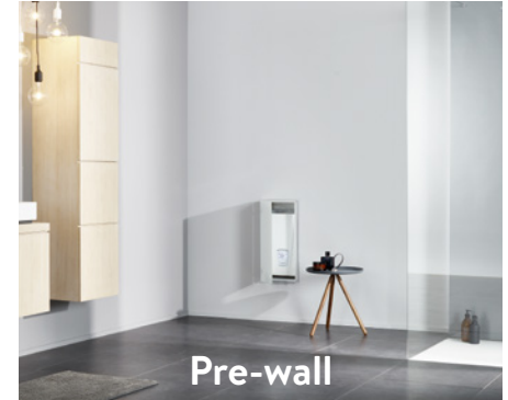
The device is integrated in the pre-wall with an inspection flap and can be operated via app or with the radio remote control.