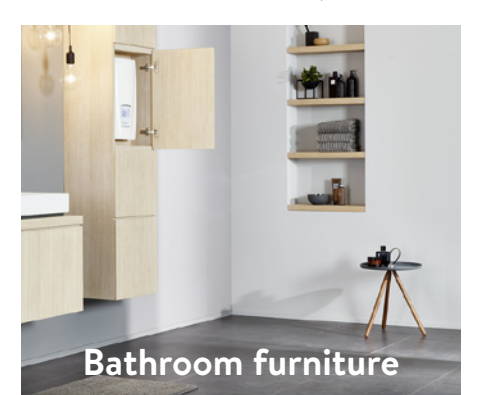
The device is hidden but always easily accessible and controllable via app or radio remote control