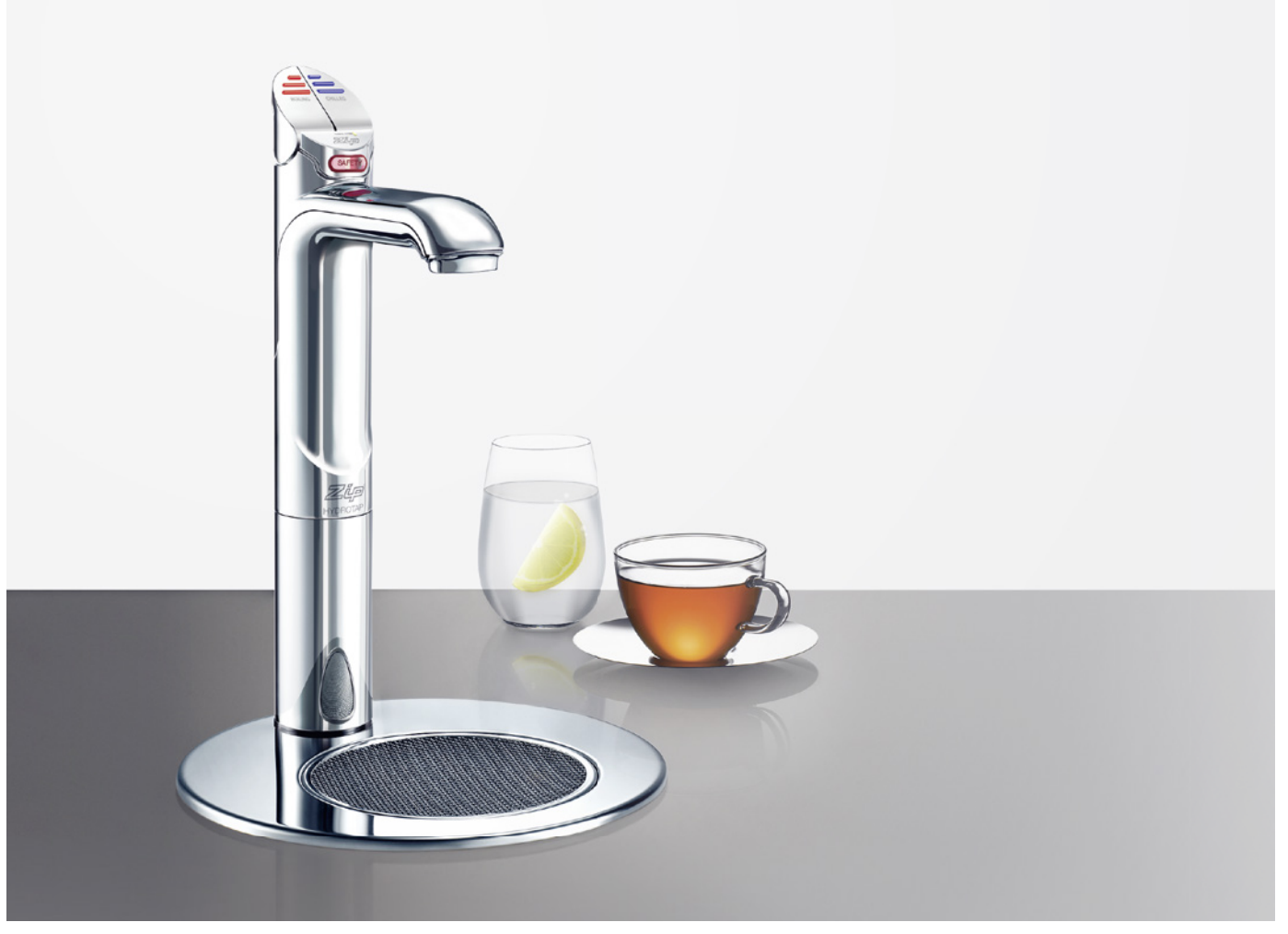
Subject to technical changes and version changes. Errors and omissions excepted. Date of publication: 02.18