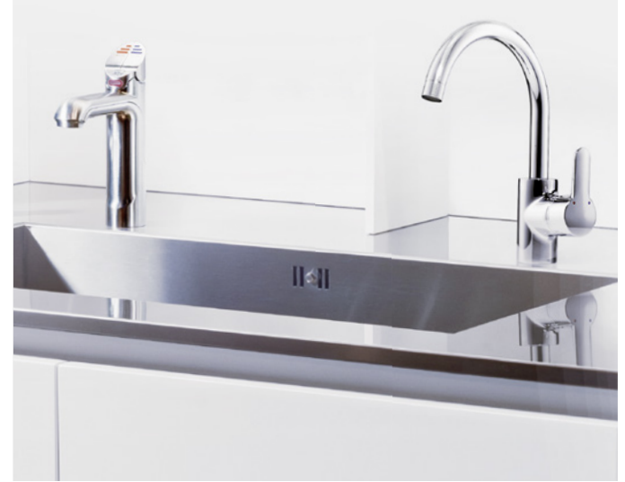
Installation as stand-alone unit with drainage font incl. extension KXTV.